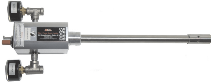
ACL 2000 Pneumatic Flame Fail Ignition System